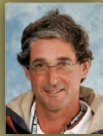
Norman Dello Joio